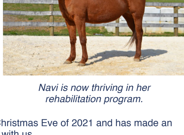
Navi is now thriving in her rehabilitation program.

Noel Navidad "Navi" arrived at DEFHR on Christmas Eve of 2021 and has made an incredible transformation in her four months with us.