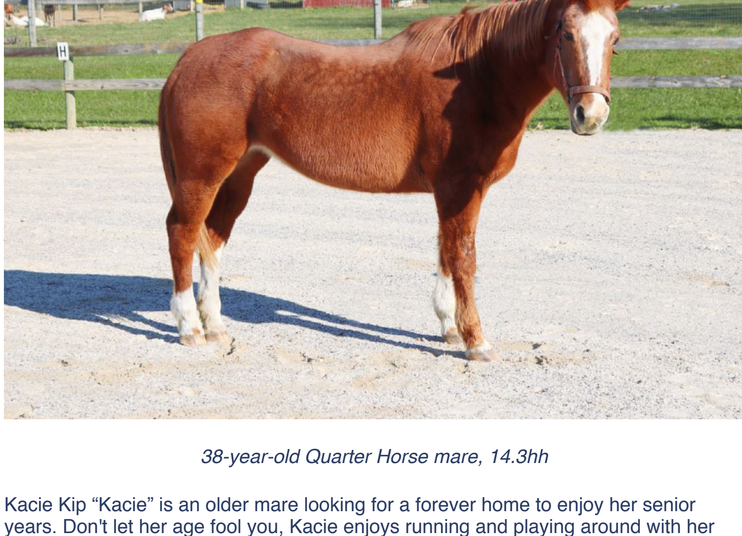
38-year-old Quarter Horse mare, 14.3hh

Kacie Don "Kacie" is an older mare looking for a forever home to enjoy her senior years. Don't let her age fool you, Kacie enjoys running and playing around with her fellow herd mates, especially her best friend, Jumpin' Jack. Calm with volunteers and staff, she enjoys receiving extra pampering and grooming time from DEFHR staff and volunteers.