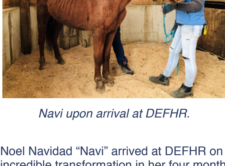
Navi upon arrival at DEFHR.